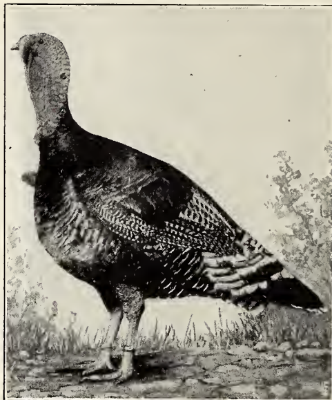
Grand Champion International Turkey Show, Chicago, 1932. (A leader in meat type; the dream of the turkey grower.)

A RECORD NEVER BEFORE EQUALLED: 78 \frac{17}{100} % of all firsts, seconds and thirds in 1930. (Best Display Bronze); 84 \frac{1}{8} % of all firsts, seconds and thirds in 1931. (Best Display Bronze, Grand Champion, First Master Breeders); 83 \frac{1}{3} % of all firsts, seconds and thirds in 1932. (Best Display Bronze, Grand Champion, First Master Breeders); 83 \frac{1}{3} % of all firsts, seconds and thirds in 1933. (Best Display Bronze, World's Fair Futurities Bronze Championship.)